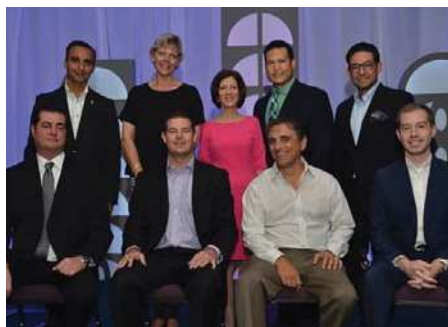
GMBHA Technology Breakfast Panel at Jungle Island