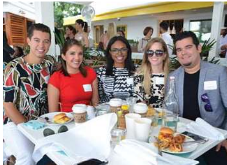
GMBHA Members Breakfast at The Standard Spa