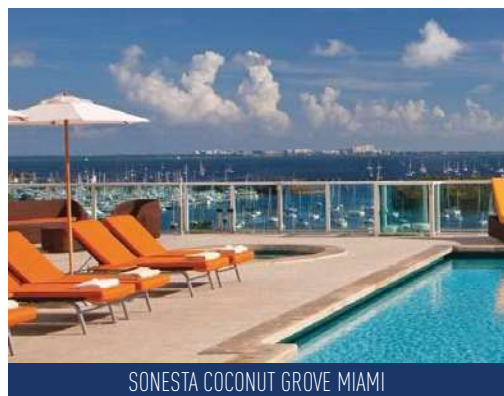
SONESTA COCONUT GROVE MIAMI

ALLIED UPGRADE ANNUAL MEMBERSHIP PACKAGE