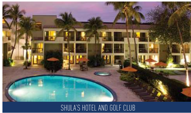
SHULA'S HOTEL AND GOLF CLUB

ALLIED UPGRADE ANNUAL MEMBERSHIP PACKAGE