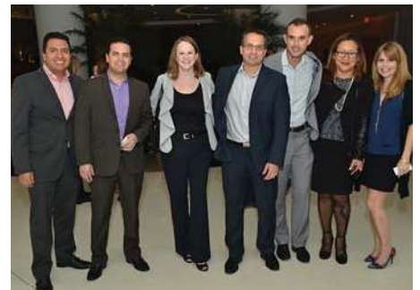
GMBHA Evening Networker at Nautilus, a SIXTY Hotel