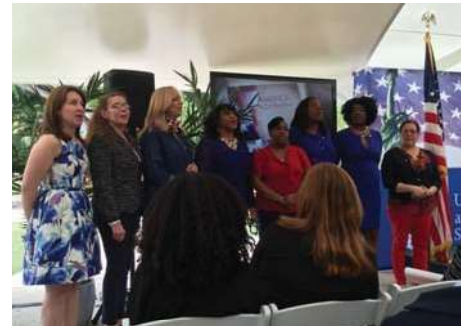
New American Workforce Naturalization Ceremony at City of Miami Beach