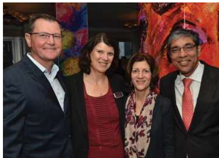
GMBHA Evening Networker at Viceroy Miami