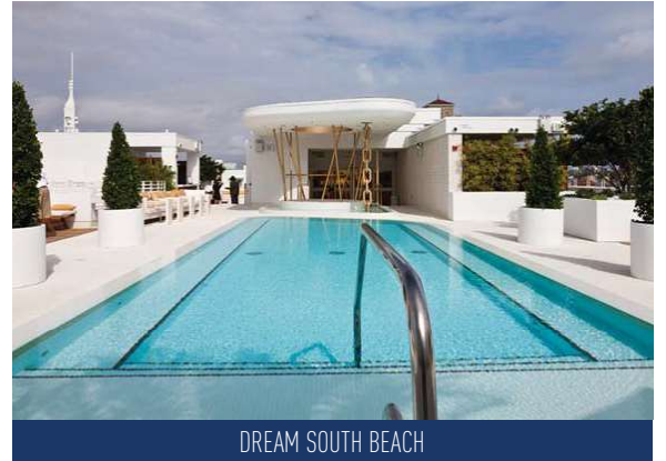
DREAM SOUTH BEACH