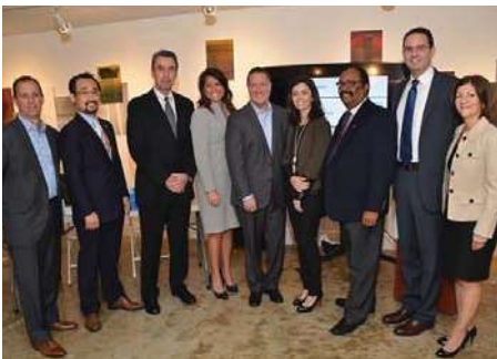
GMBHA Revenue Management Panel at FIU Miami Beach Urban Studios