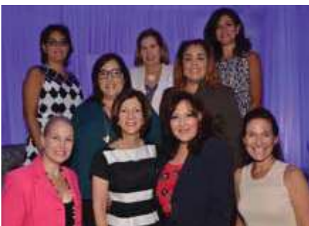
GMBHA Directors of Catering Panel at The Ritz-Carlton Coconut Grove, Miami