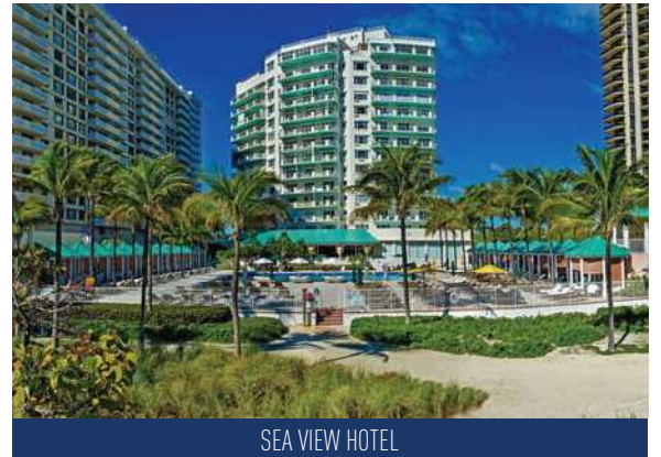
SEA VIEW HOTEL