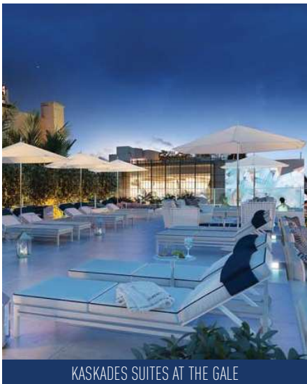
KASKADES SUITES AT THE GALE