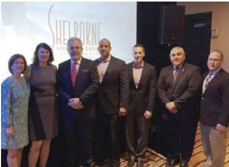
GMBHA Panel Discussion at the Shelborne