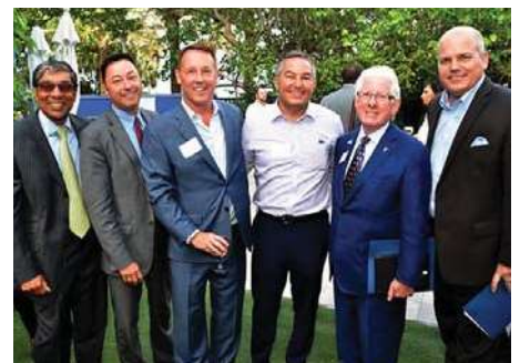
GMBHA Evening Networker at Shore Club