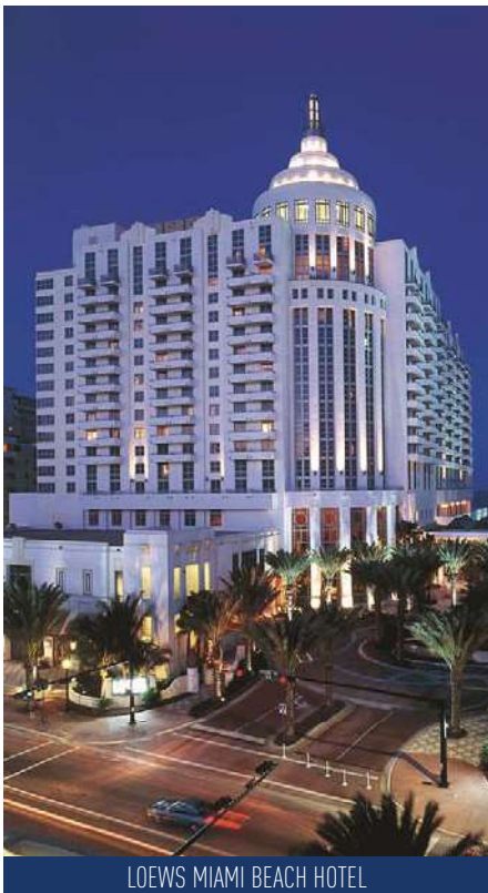
LOEWS MIAMI BEACH HOTEL