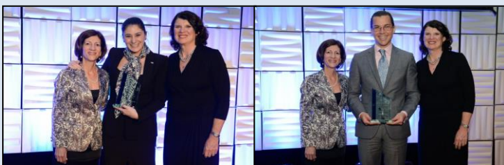
5 th Annual Leadership Awards Reception Winners, Manager of the year Over 200 Rooms (left), Manager of the year Under 200 Rooms (right)