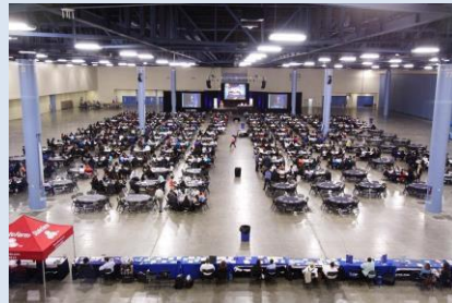
2 nd MEGA NAF Student Industry Conference