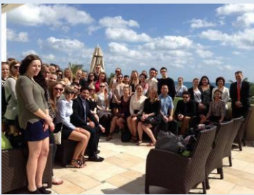
Denmark University Student Tour