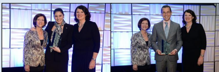
5 th Annual Leadership Awards Reception Winners, Manager of the year Over 200 Rooms (left), Manager of the year Under 200 Rooms (right)