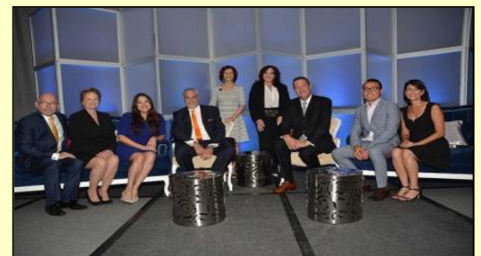
Directors of Catering Panel