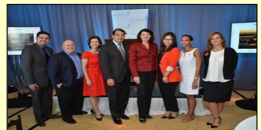
Welcoming Chinese Visitors