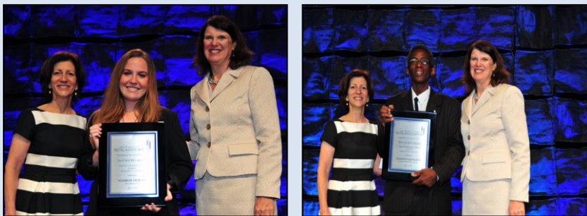
21 st Annual Inn Key Award Winners