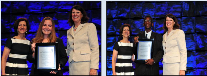
21 st Annual Inn Key Award Winners